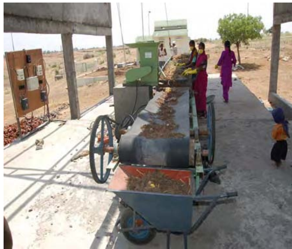
SHREDDING OF WASTE