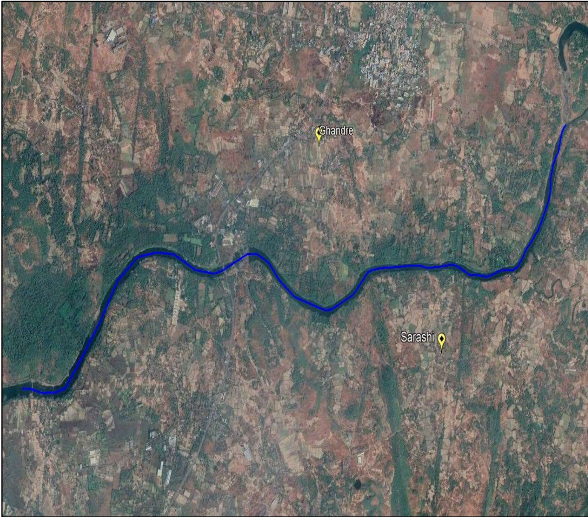
Figure 1 Stretch of Vaitarna River