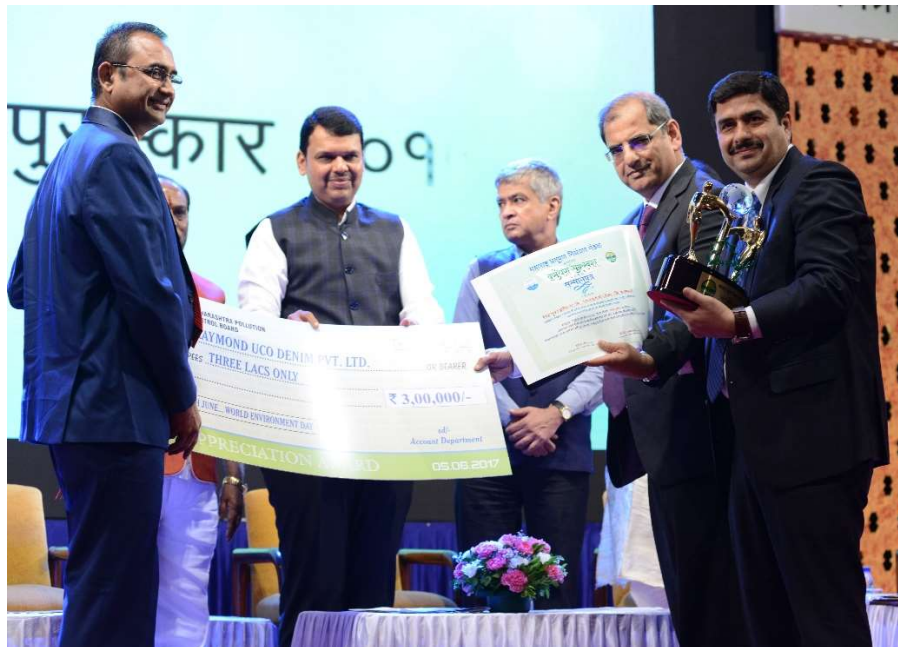
On the eve of World Environment Day on 5th June 2017, Hon'ble Shri Devendra Fadnavis, Chief Minister, GoM giving away Vasundhara Awards to the entrepreneurs who have introduced best environment-friendly practices in their industry, at Y. B. Chavan Auditorium, Mumbai.