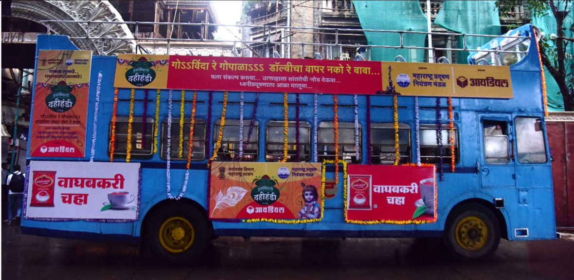
Anti-noise pollution awareness rally on the eve of Dahi-handi (Gopalkala) festival was organized with participation of famous Marathi film industry celebrities on the Open Deck Bus Service of Best Transport Service in the month of August 2017.