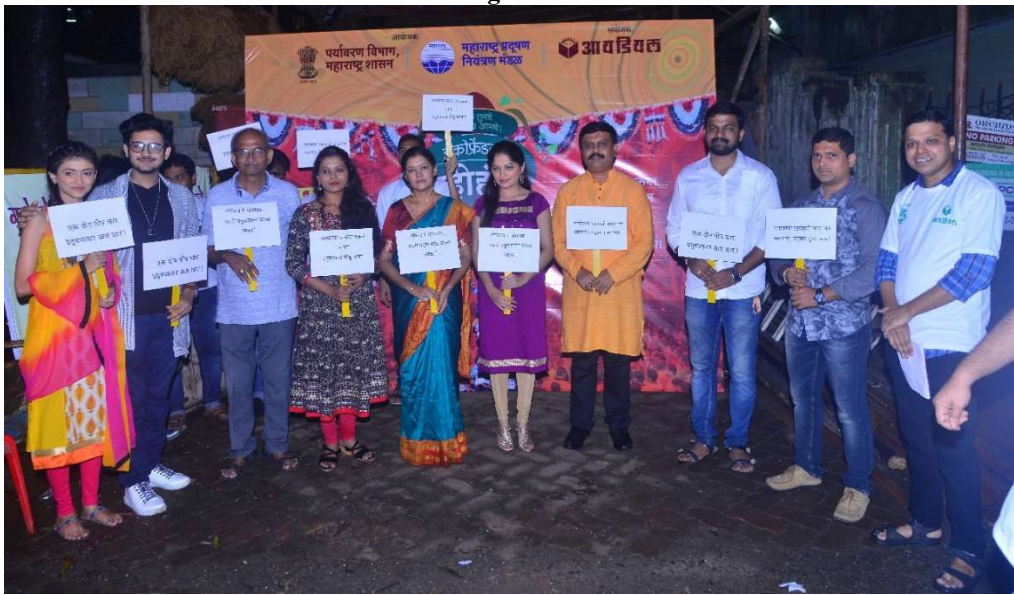
Anti-noise pollution awareness rally on the eve of Dahi-handi (Gopalkala) festival was organized with participation of famous Marathi film industry celebrities on the Open Deck Bus Service of Best Transport Service in the month of August 2017.