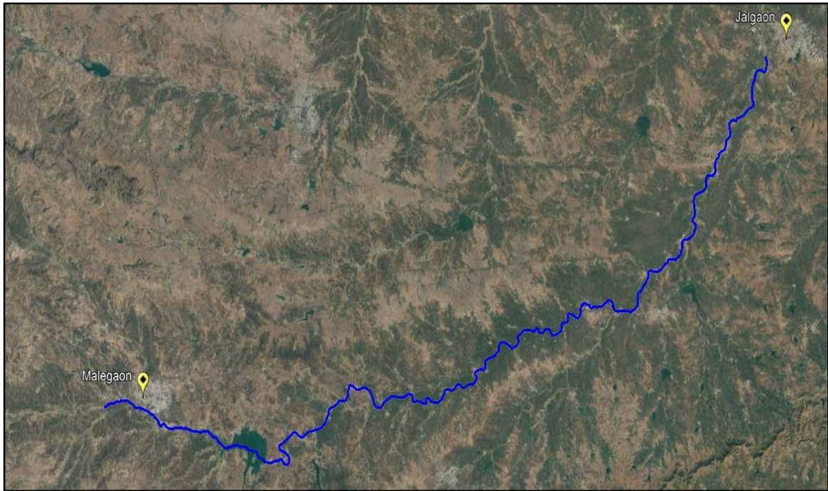
Figure 1 Stretch of Girna River