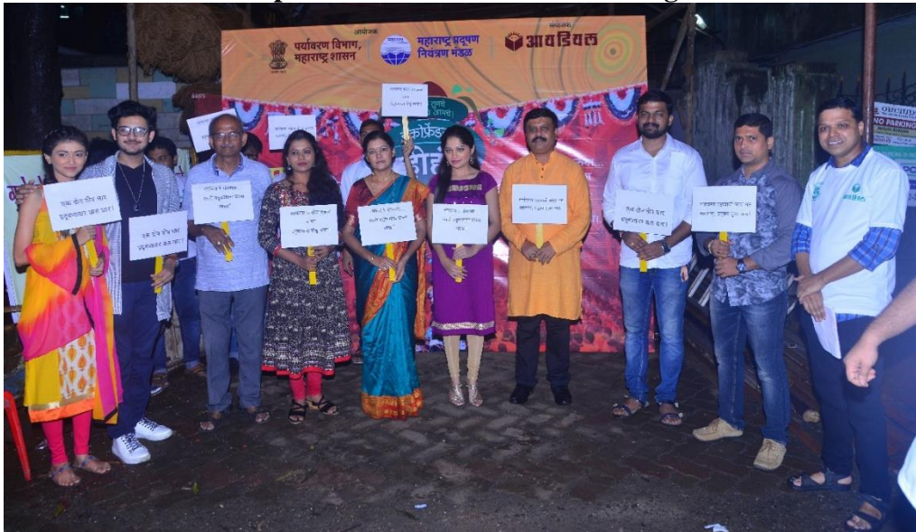
Anti-noise pollution awareness rally on the eve of Dahi-handi (Gopalkala) festival was organized with participation of famous Marathi film industry celebrities on the Open Deck Bus Service of Best Transport Service in the month of August 2017.