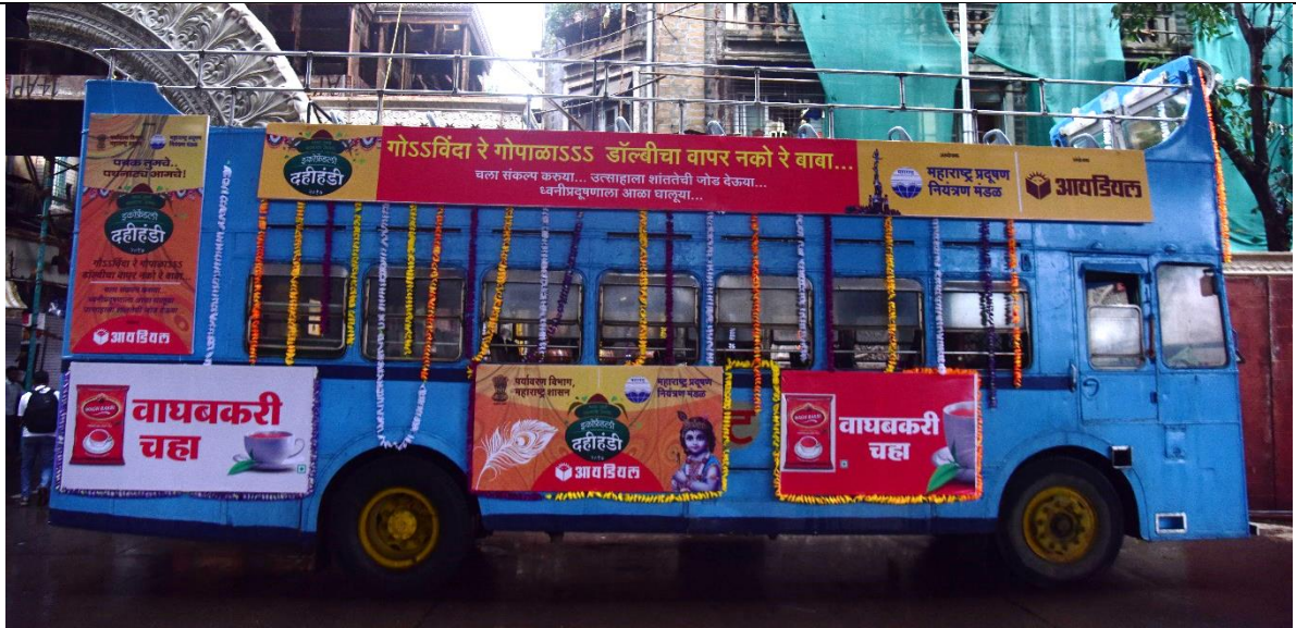
Anti-noise pollution awareness rally on the eve of Dahi-handi (Gopalkala) festival was organized with participation of famous Marathi film industry celebrities on the Open Deck Bus Service of Best Transport Service in the month of August 2017.