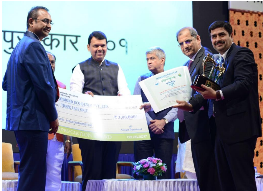
On the eve of World Environment Day on 5th June 2017, Hon'ble Shri Devendra Fadnavis, Chief Minister, GoM giving away Vasundhara Awards to the entrepreneurs who have introduced best environment-friendly practices in their industry, at Y. B. Chavan Auditorium, Mumbai.