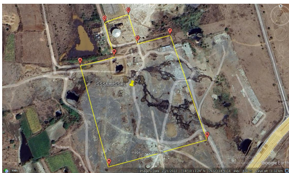
Figure 1 Google map showing plot boundary of the project

The required land for the proposed industrial unit is in possession. There are no tropical forests, biosphere reserves, national parks, wildlife sanctuaries, or coral formation reserves within a 10-kilometer influence zone of the site.