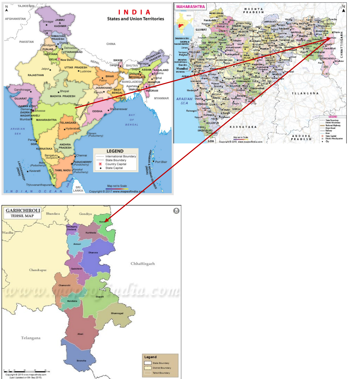
Figure 1: Location Map of the Project Site