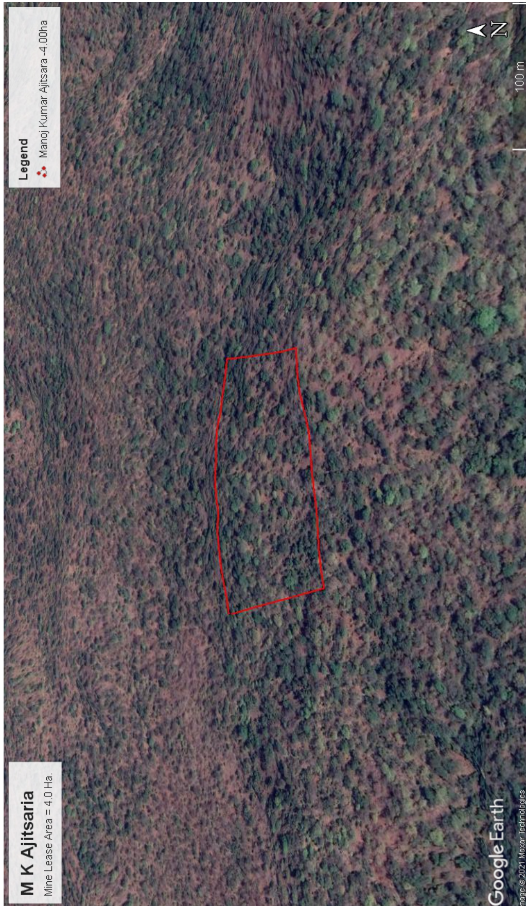
Figure 3: Google Image of the Project Site