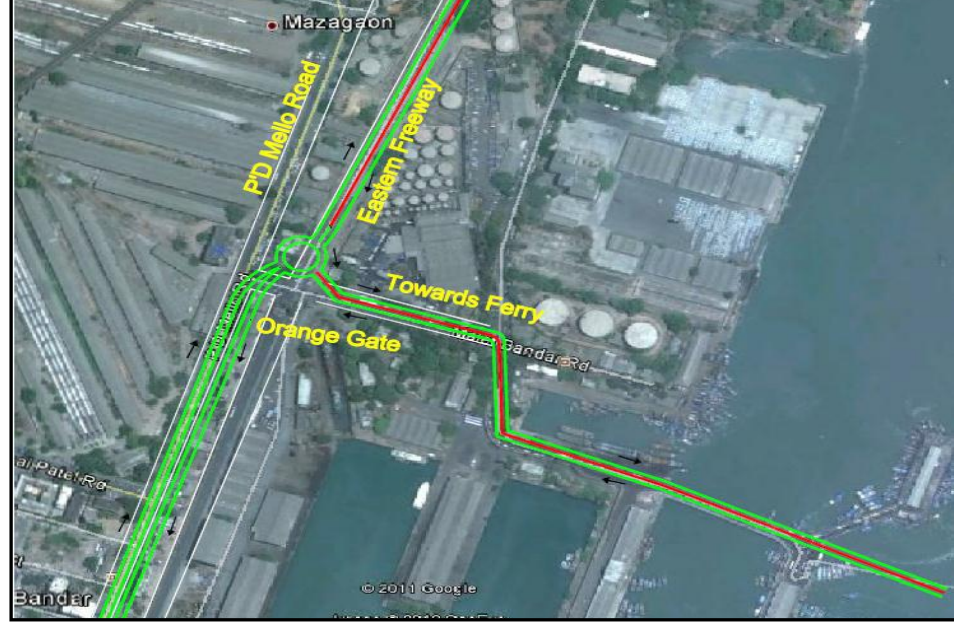
Figure 4: Elevated road – Ferry Wharf