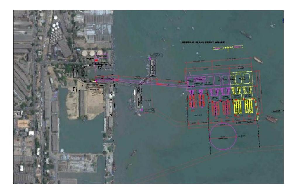
Figure 2: Google image with the project concept super imposed

The proposed site at Ferry-wharf is located at an approximate distance of 1 Km from the P'Dmello road. The selected location offers excellent tranquility as wave heights do not exceed 0.5m even in the South West Monsoon. A maintained water depth of 4.2 m is available at low tide which is sufficient for the proposed Ro-Ro Ferry Service.