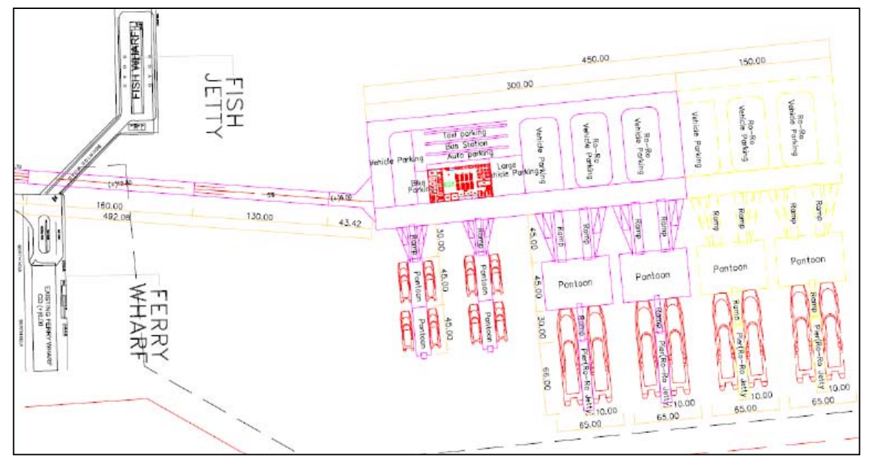
Figure 3: Concept Layout

Quantifying the various parametres like design, scope for future expansion, encroachment into existing P & V channel the most prefered concept Layout with no significant disadvantage is as given below: