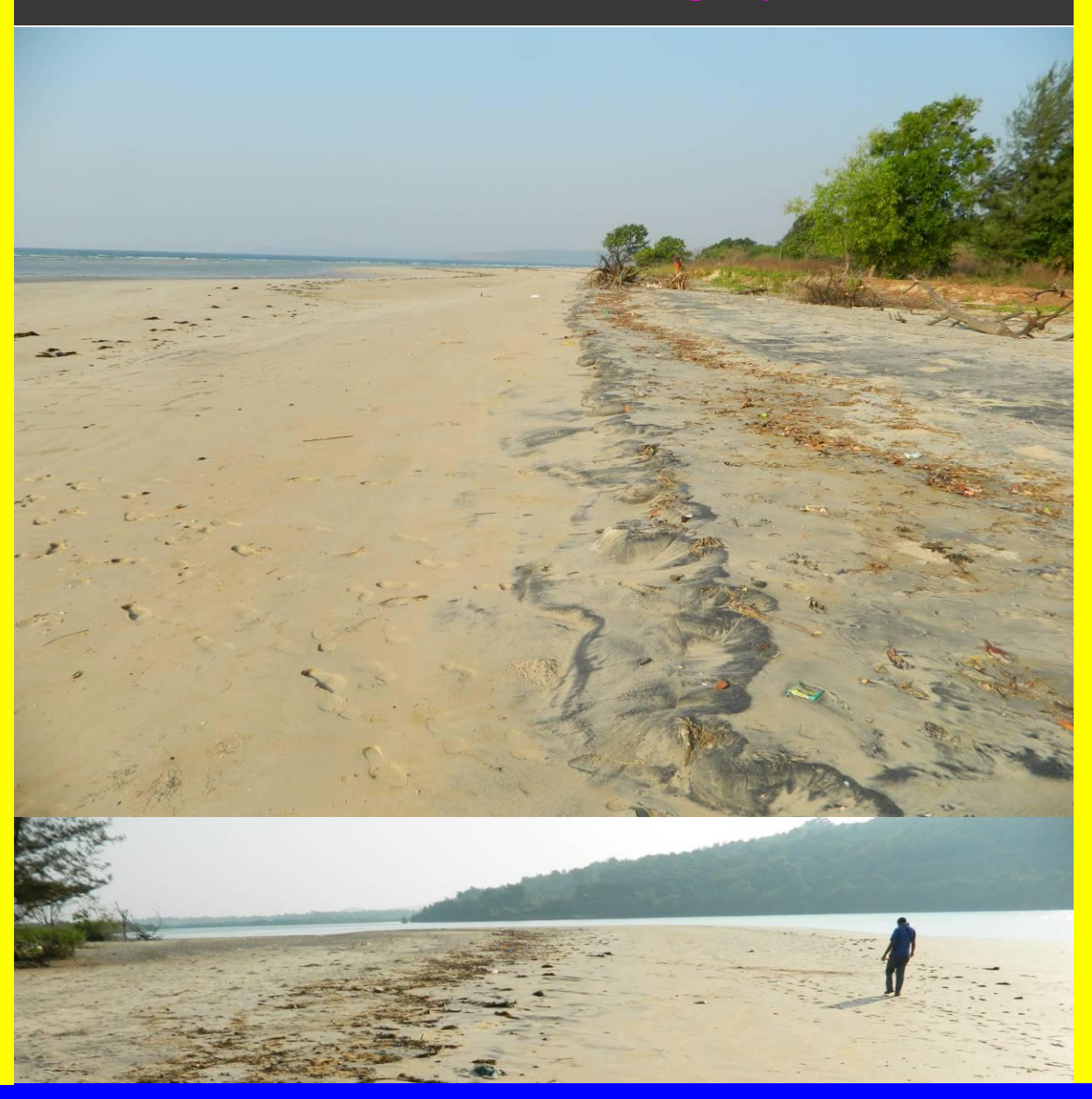
September - 2016

Environmental Consultant: Aditya Environmental Services Pvt. Ltd., Mumbai QCI- NABET Accredited EIA Consultant