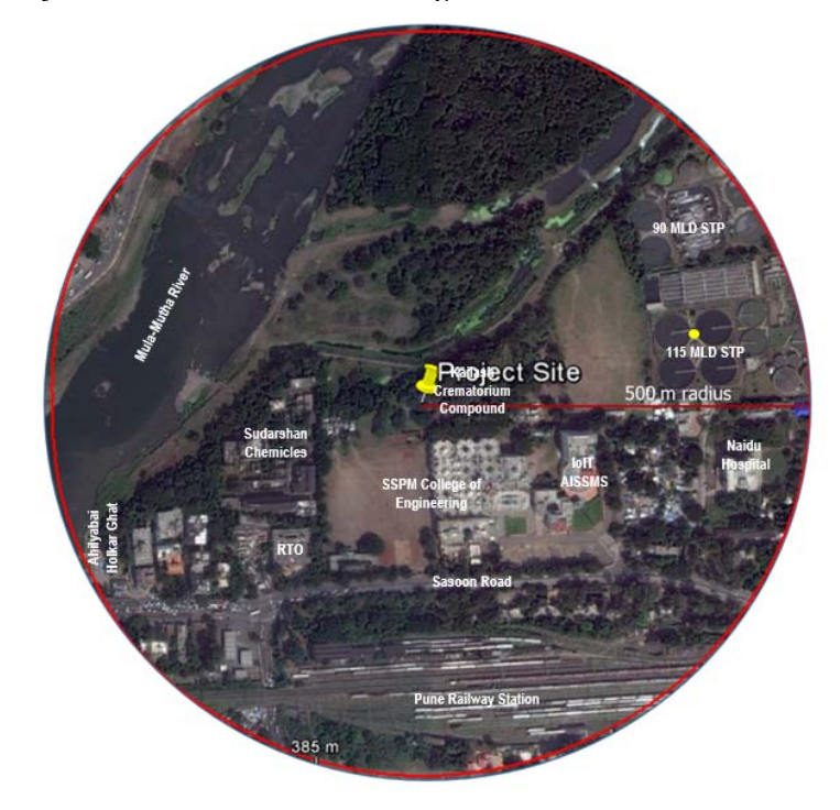
Figure 1.1 Site Key Location and Immediate Neighbourhood