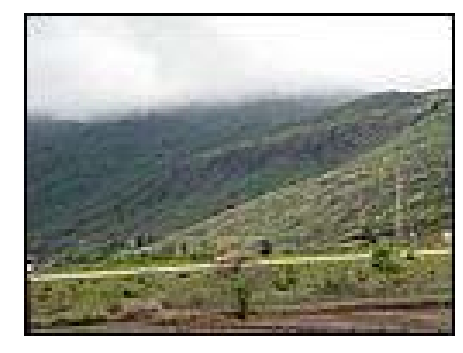
Plate 1. Hills of Maval

Towards East of "Ghatmatha", 15-30 km belt is known as "Maval" which is hilly and undulating. A strip on the West of Taluka Junnar, Ambegaon, Khed, Bhor and Western & Central part of Taluka Maval, Mulshi and Velhe comes under this region. The altitude of this region ranges in between 100 and 500 m above MSL.