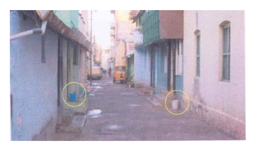
Home Composting – Citizens's Action

Urban Local Bodies, MPCB and State Government are working together to manage the increasing load of MSW, however public participation and community level treatment of MSW will help to decrease the load on Municipal solid Waste Management.