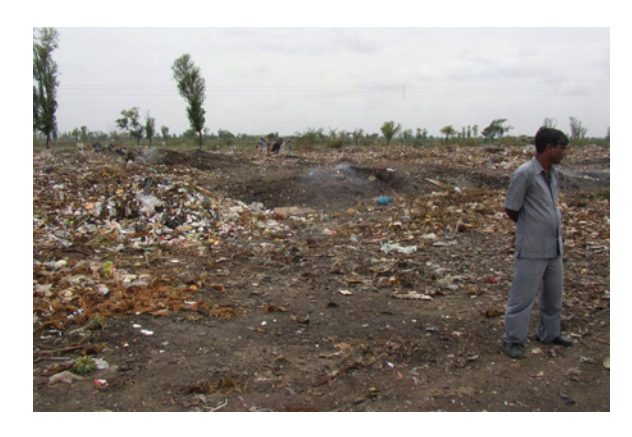
Present SW Disposal Site