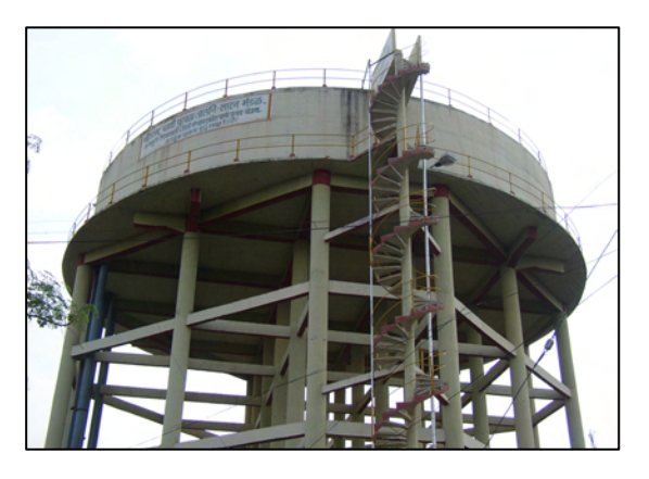
ESR at Kankuri Rd