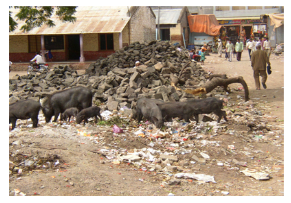
Uncollected solid waste