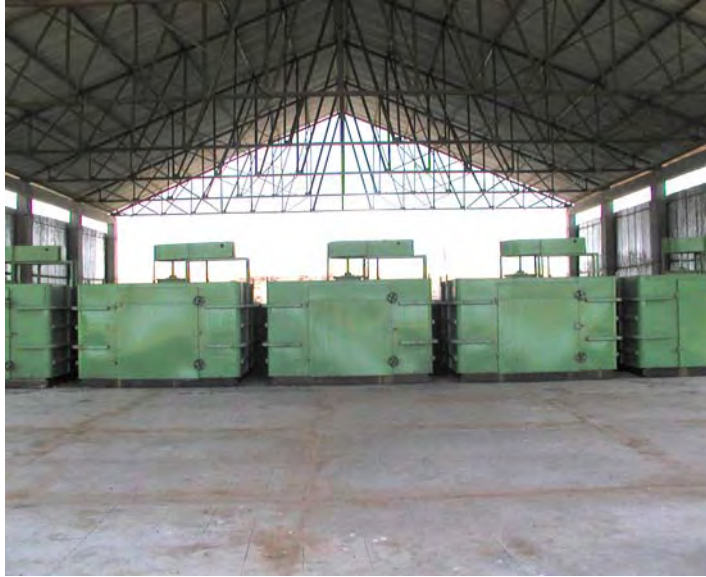
INSTALLATION OF VESSEL