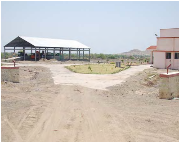
INTERNAL ROAD AND OVERVIEW OF SITE