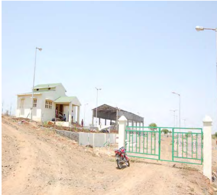
OVERVIEW OF SITE