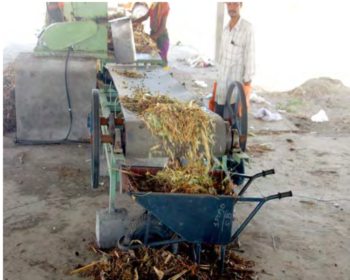
CONVEYOR BELT AND WHEEL BARROW