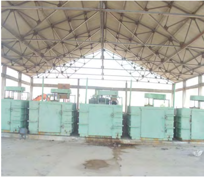
INSTALLATION OF VESSELS