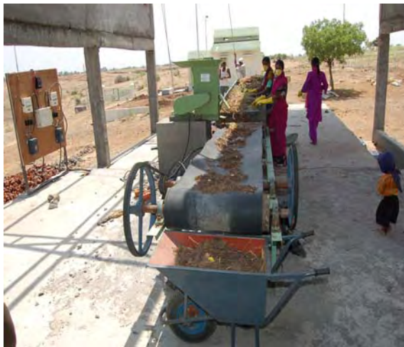
SHREDDING OF WASTE