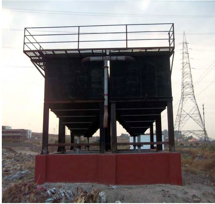
Leachate Collection system