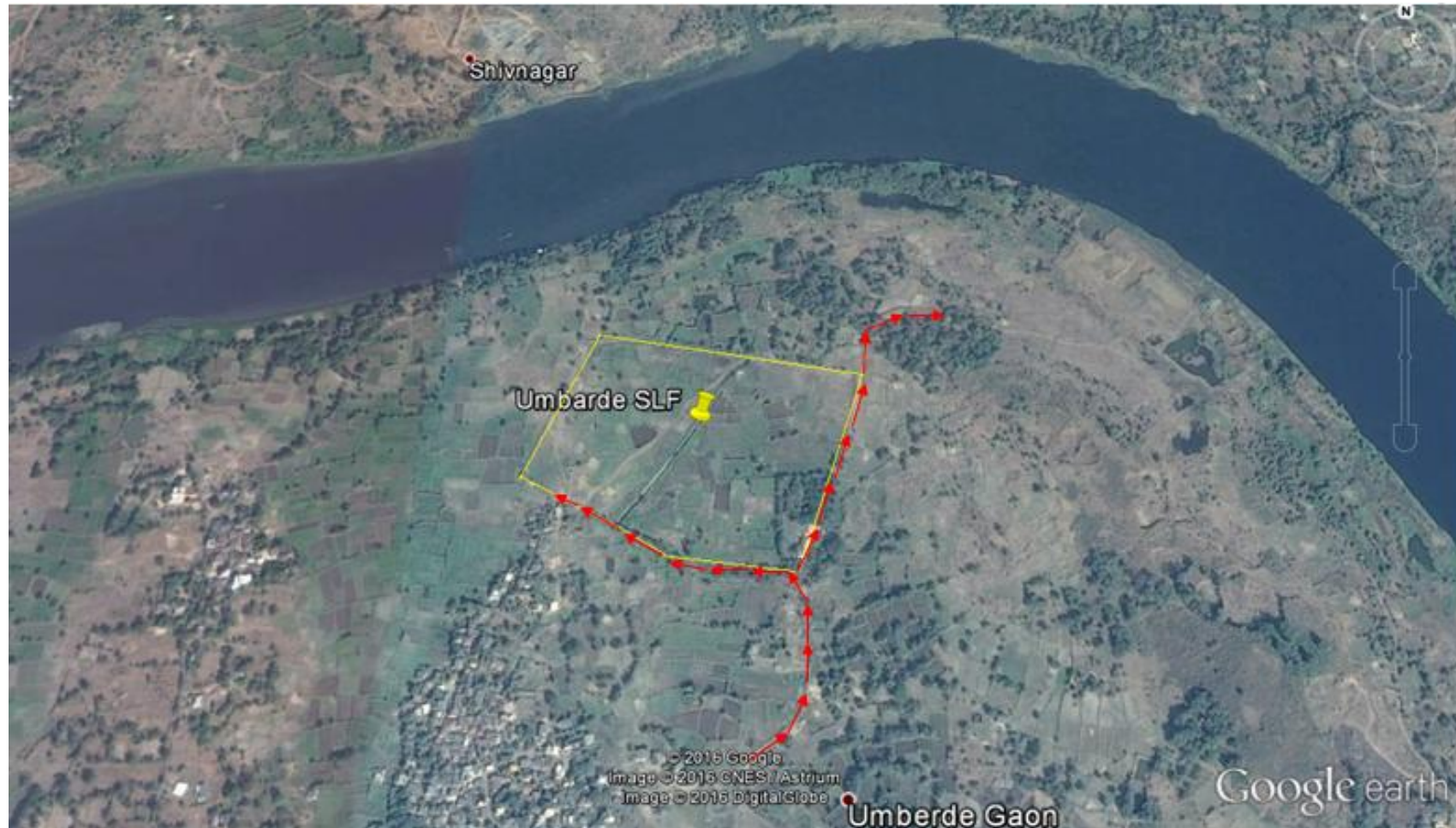
Figure 2: Satellite Image of the Project site