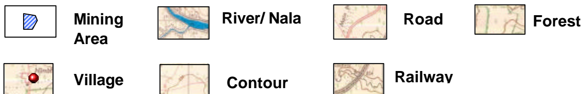
FIG: TOPOGRAPHIC MAP SHOWING STUDY AREA (10 KM RADIUS)